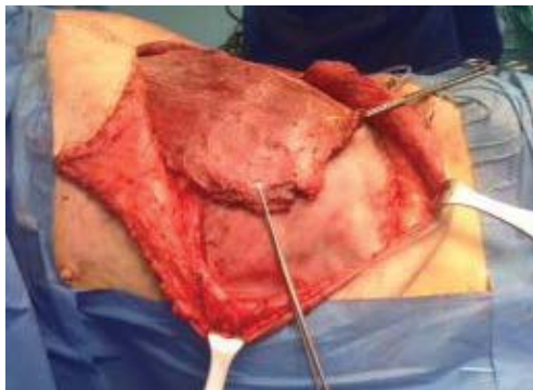
Figure 4:- Latissimus dorsi flap. Asterisk: mesh.

After 18 months of follow-up no hernia recurrence has been detected.