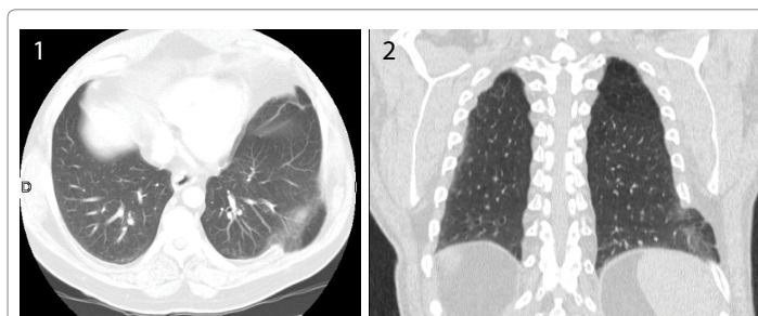
Figure 1, 2:- CT: pulmonary hernia.

At first, the surgical reparation consisted of cerclage with